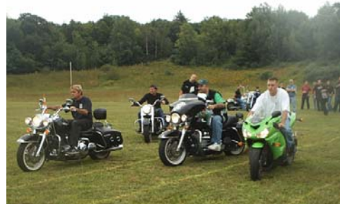
How Slow Can You Go!

It's full steam ahead for the July 12, Rodeo at the Glastonbury Elks Lodge No. 2202, 98 Woodland Street, Glastonbury, CT! We want to make this our biggest event of the year but we are going to need all the help we can get.