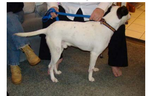
Chance 5 Weeks Later and approx. 20 lbs. heavier!

Well, the top 5 names were chosen and put out to be voted on by our supporters. They voted and the majority chose "CHANCE" for his name. Since March 7th was the day his name was given to him, we deemed that to be his birth date! Chance has also been made the official B.A.A.C. mascot! So, please welcome Chance to the B.A.A.C. family. We hope that who ever