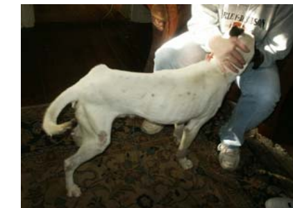
Chance One Week Later and 8 lbs. Heavier

day like this. Once a day he got plain yogurt mixed in because he was on antibiotics for the sores and the antibiotics were killing the good bacteria along with the bad. After a week or so, she was able to bump up the amount of food. Now with satin balls mixed in his diet, he's starting to fill in w/ some needed meat & muscle on