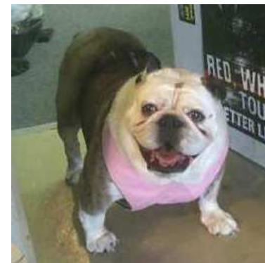
English Bulldog, Daisy

lazy daisy, daisy mayhem, smoothy, meatball, pork chop). After doing some research on a breed suit-