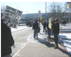
Animal Advocates pleading for justice in front of the Bristol Superior Courthouse.