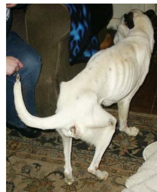
Chance, when he had no name Just After Being Rescued From the Hartford Animal Shelter